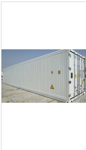
40' RF Reefer Container