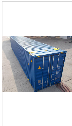
45' HC Dry Container